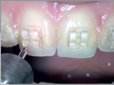
Debonding with ER:YAG