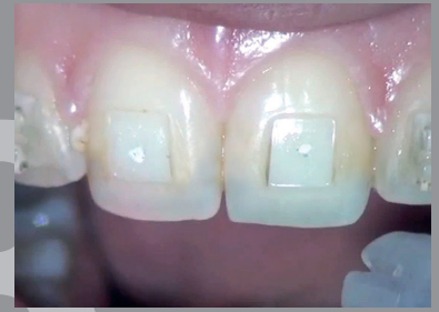
Intact enamel surface