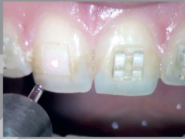
Easy bracket removal